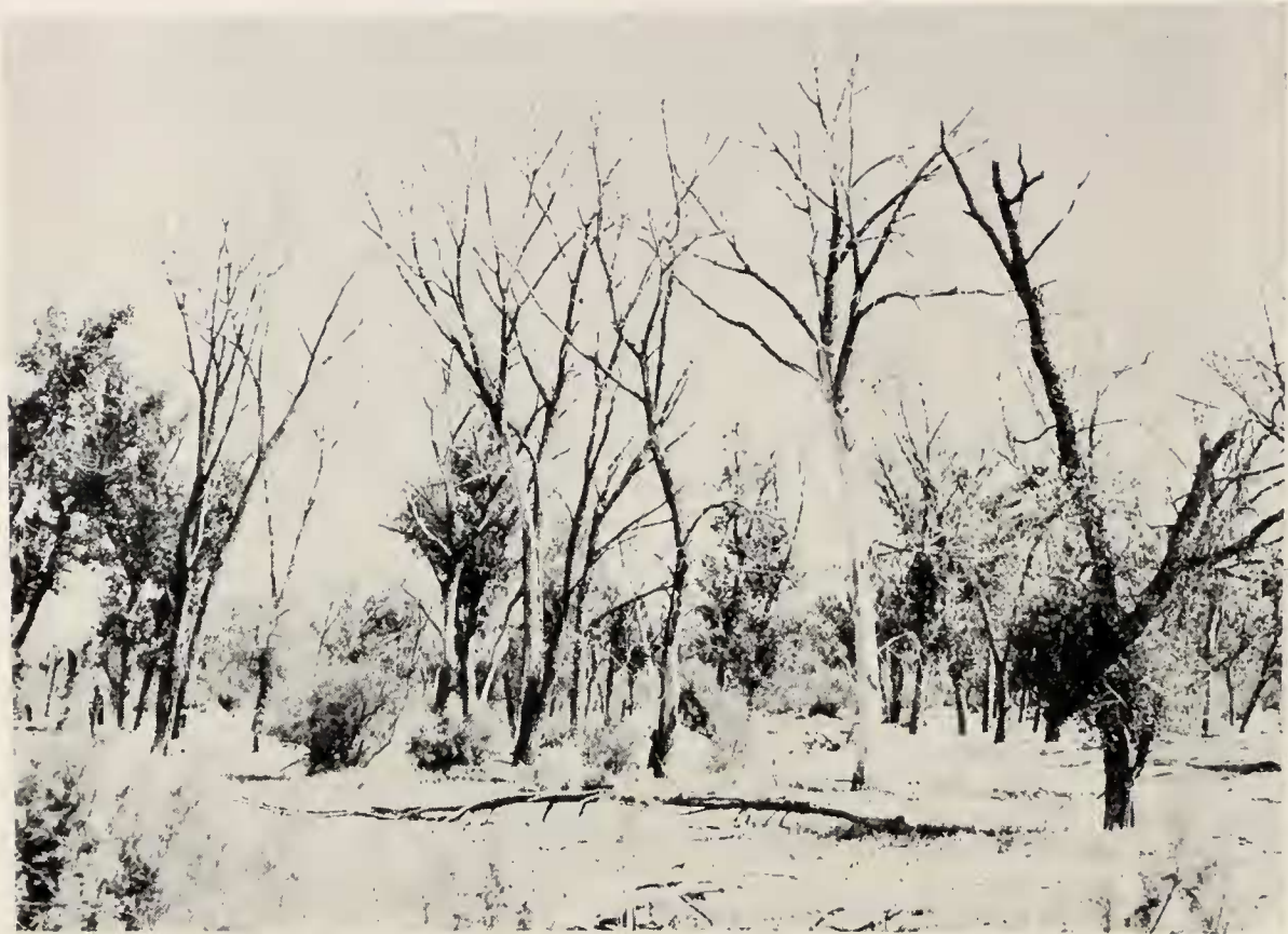
FIG. 1. Breeding habitat of Lewis' and Red-headed woodpeckers in southeastern Colorado—cottonwood riparian woodland. Photograph taken in August, 1970, on the Arkansas River, Crowley County, Colorado.

gentii ) mixed with a variety of shrubs, herbs, and smaller trees, especially willow ( Salix sp.) and tamarisk ( Tamarix pentandra ). Ground fires are common as an agricultural attempt to reduce shrubs and increase grass production. The result is that much of the habitat is open and park-like (Fig. 1). Both species nested in dead or partially decayed cottonwoods and foraged extensively on the ground or by flycatching in clearings between the trees. The second breeding habitat was farmland (Fig. 2). Here the woodpeckers nested in cottonwoods along roads or around buildings and foraged for emergent insects largely in or over adjacent cultivated fields.