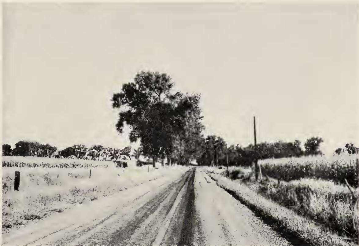
FIG. 2. Breeding habitat of Lewis' and Red-headed woodpeckers in southeastern Colorado—farmland. Photograph taken in August, 1970, in Crowley County, Colorado.

were permanent residents in our study area (Hadow, MS), storing and utilizing corn as a winter food supply. This may explain the larger numbers of Lewis' Woodpeckers which we observed in agricultural areas, where the birds nested at or near their winter storage sites.