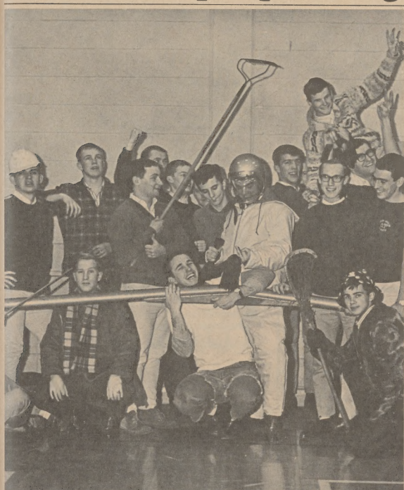
43-MAN SQUAMISH, ANYONE? —When the Probate judge flips a new Spanish peseta, these members of the U of A 43-man squamish team will take to the main gym floor to decide the North American 43-Man Squamish Championship when they take on the UAC team. The game will be played Saturday during halftime of the Golden Bear-Dinocour basketball game.