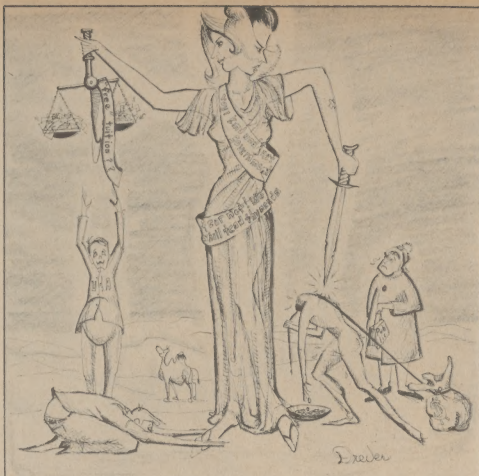
there are two distinct sides to every question

University officials say the undergraduate is paying a considerable amount of money for graduate students' tuition fees, but it is obvious he is not receiving full value for his money when he must write examinations which do not cover a course which he is being denied the opportunity of being exposed to.